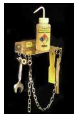
WALL MOUNTED CHAINING BRACKET INCORPORATES TOOL HOOKS TO STORE CYLINDER CHANGE-OUT TOOLS.