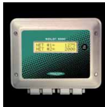
THE SOLO 1000 DIGITAL WEIGHT INDICATOR IS SIMPLE TO OPERATE AND INCLUDES 4-20MA OUTPUTS